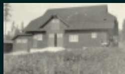
"Fairacres" Stables 1914