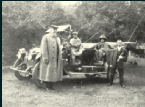
Ceperley family with chauffeur c. 1914