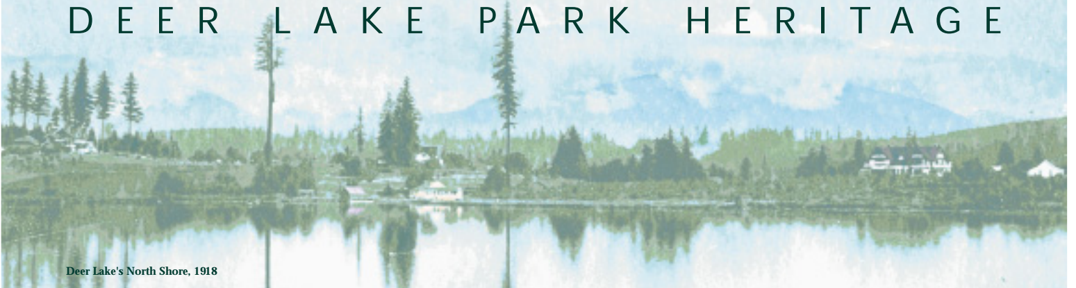
Deer Lake's North Shore, 1918