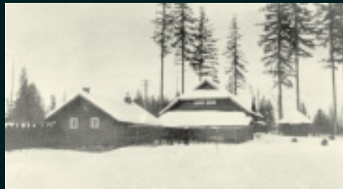
A winter view of cottage and stables 1913

At some point in the building's history the hay loft was enlarged with a large gabled projection. However, despite these changes, the building is remarkable for its survival and the originality of the architectural features both inside and out.