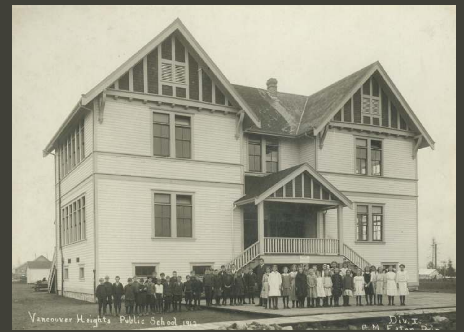
The original 1912 Gilmore Avenue School.

This heritage marker was dedicated in 2005 to mark the 90th anniversary of this building's dedication and service as a landmark of the Heights neighborhood.