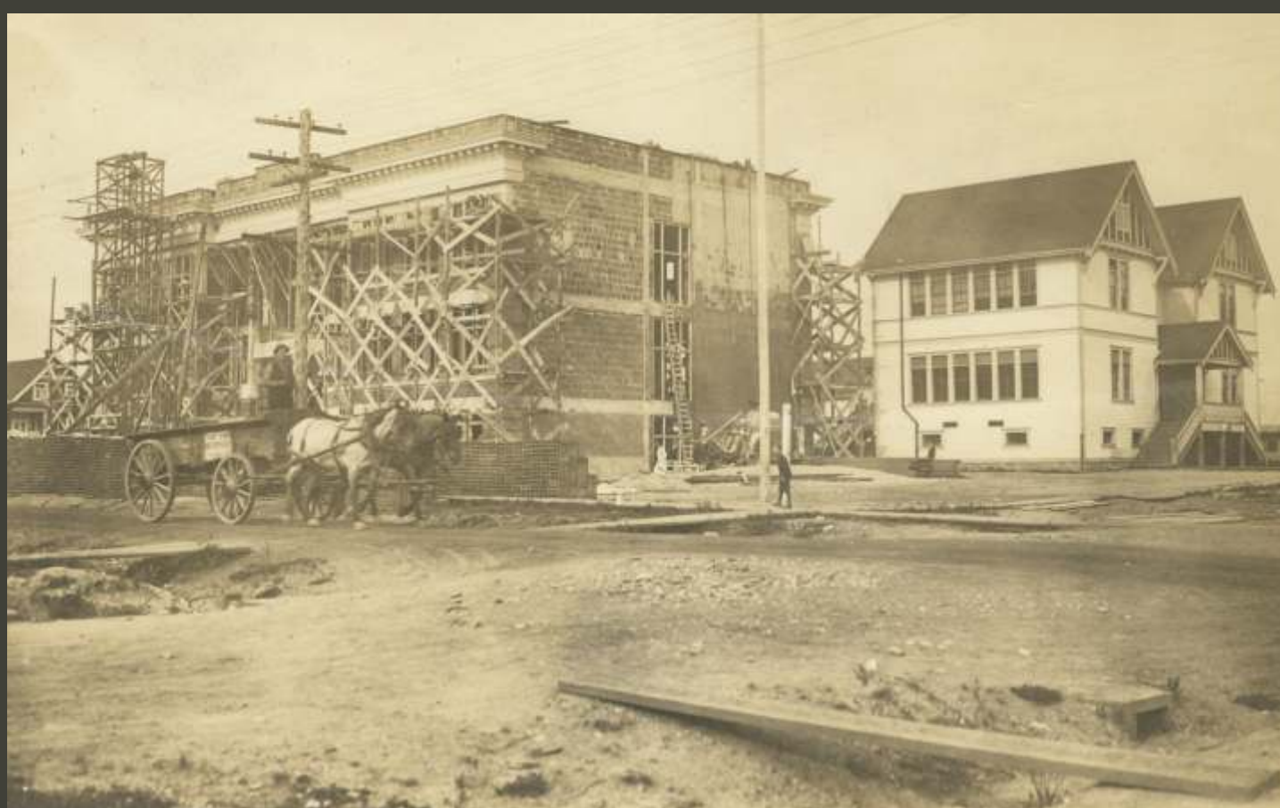
Gilmore Avenue School under construction, 1915.