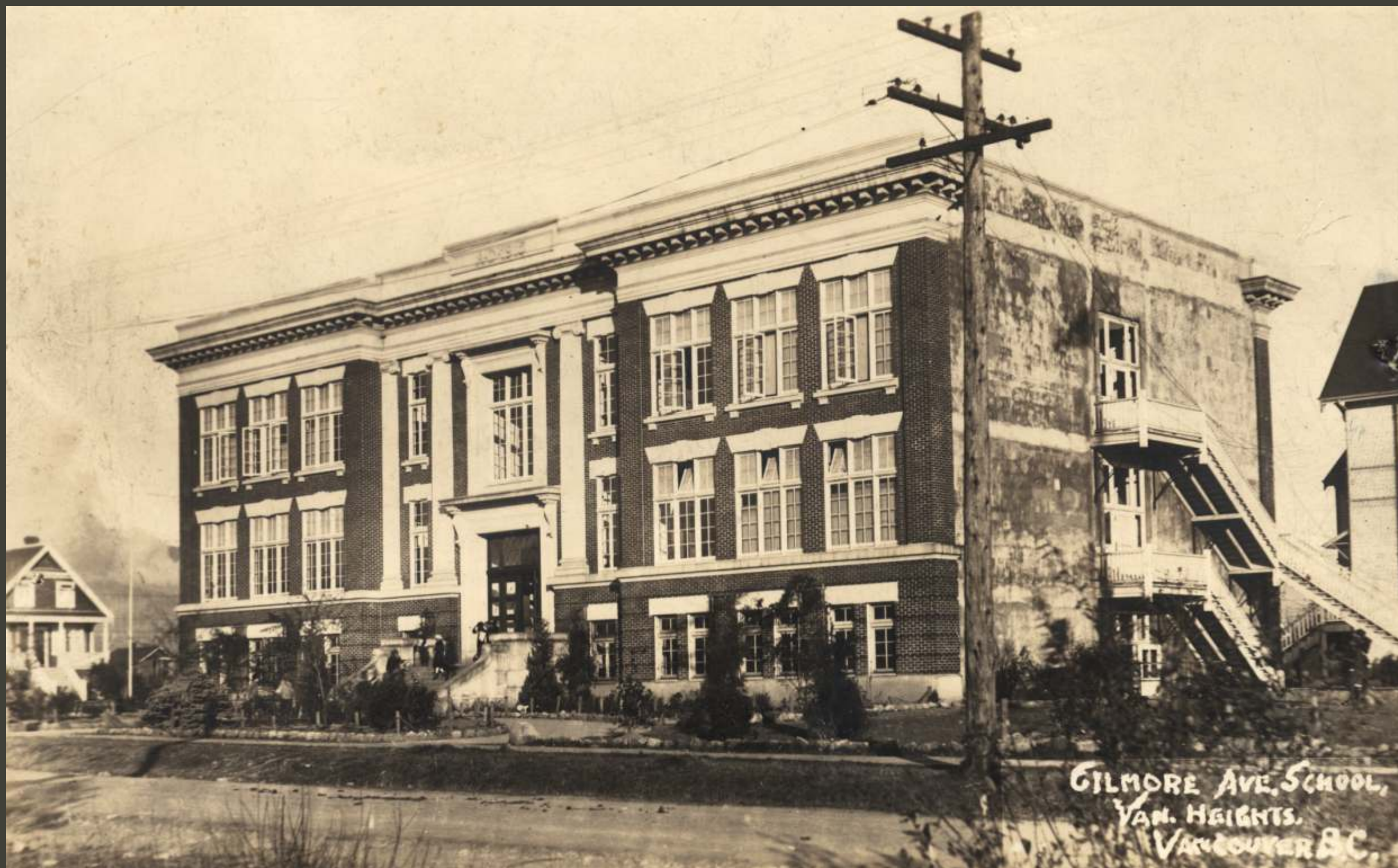
Gilmore Avenue School, 1920.

The development of the "Vancouver Heights" subdivision of Burnaby began in 1909 at the height of the Edwardian real-estate boom. Practically overnight, hundreds of new residents were attracted to this fully serviced suburb with its spectacular views. This instant community needed a school and the first classes of the Vancouver Heights School were hastily organized and held in tents in 1911.