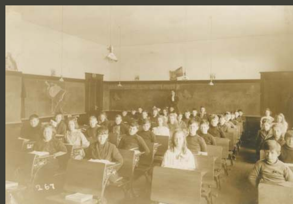
Classroom, circa, 1915.

All historic photographs and materials are from the Gilmore Community School collection.